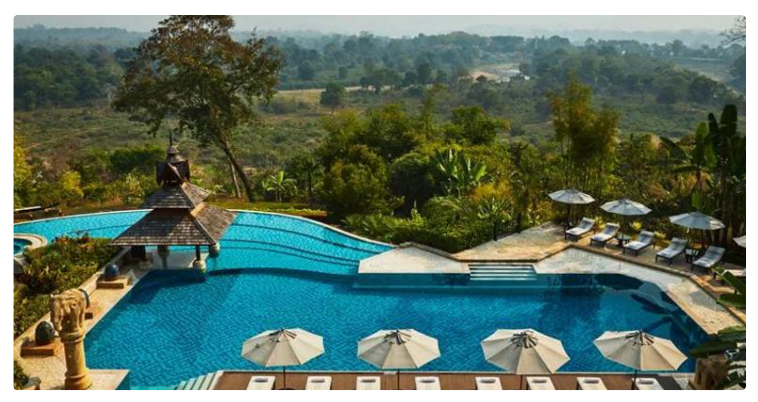
FAM to Thailand

smirnov@cgjourneys.com https://cgjourneys.com